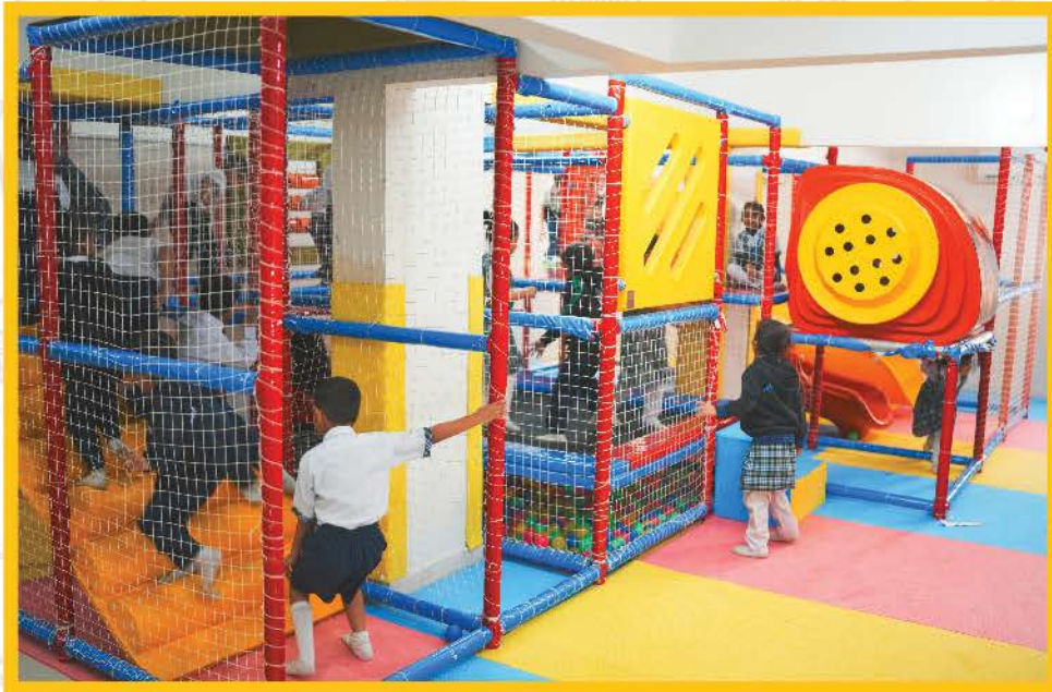
INDOOR PLAY AREA